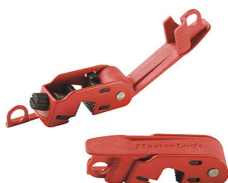
Circuit Breaker Lock Out