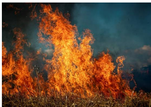
The new Fire Danger Ratings

The risk of bushfires and other weather hazards must be considered when planning fieldwork. Field workers must check weather and fire risk forecasts when planning field work and have plans and support mechanisms in place to mitigate risk.